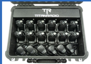
6PEL - Pelican® Case Charger