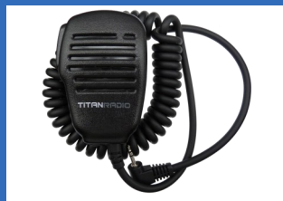
TRSM - Remote Speaker Mic