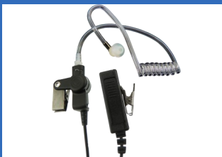
TRSK - 2-Wire Surveillance Kit