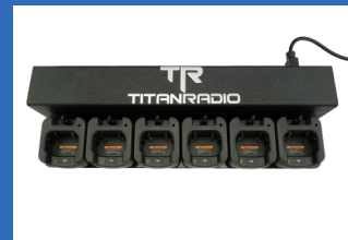
6MUC - 6 Unit Gang Charger